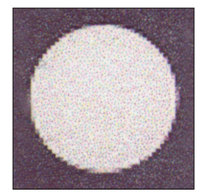
Control, t = 0 days