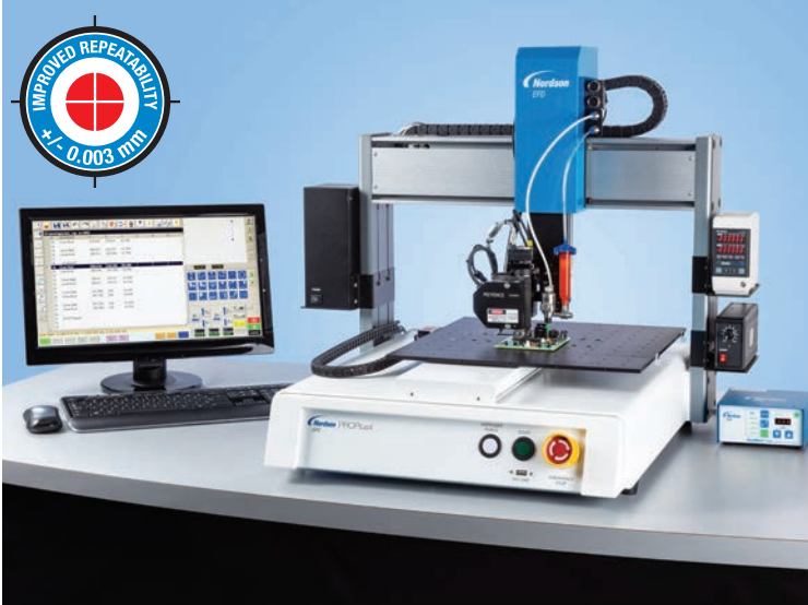
Integrated vision and laser make the PROPlus / PRO Series a complete automated solution.

A complete, vision-guided automation solution