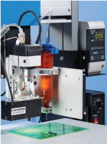
Smart vision CCD camera verifies product presence and orientation.